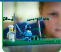
Stop Motion Animation